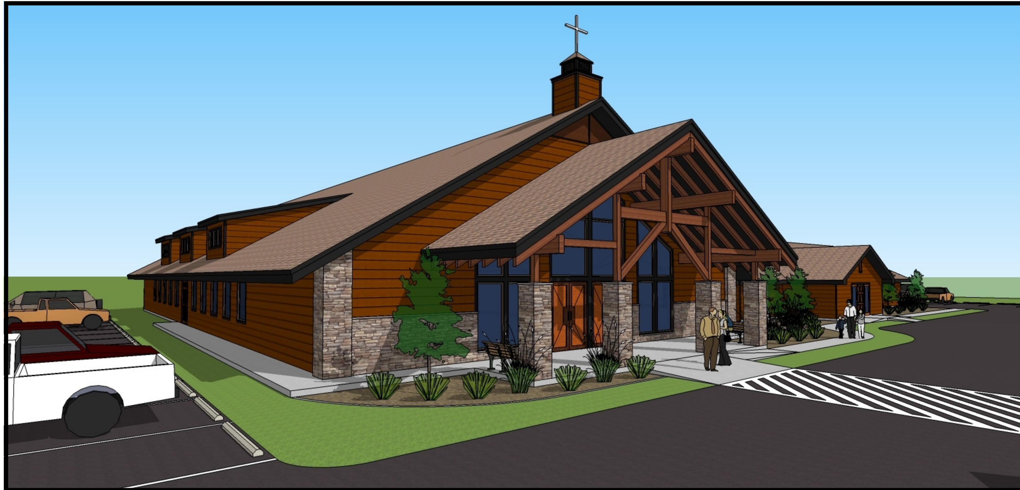
PERSPECTIVE OF CHURCH EXPANSION