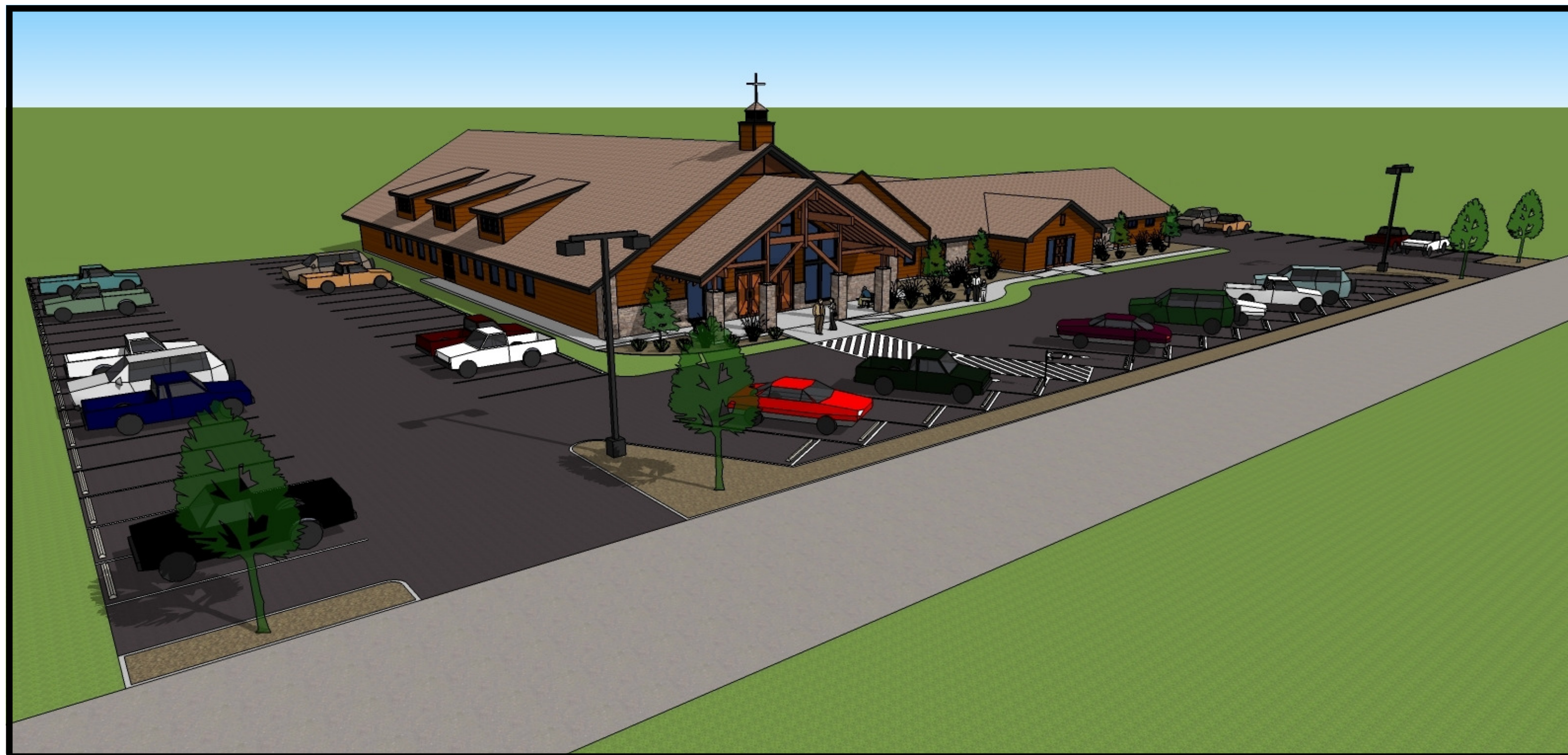
PERSPECTIVE OF CHURCH EXPANSION