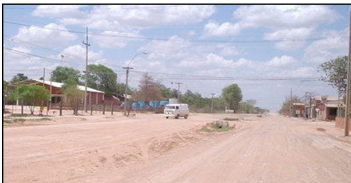
Filadelfia, Paraguay, our new home, is a hot, dry frontier town where temperatures can reach 110° in the summer, 30° in the winter and rainfall is measured in millimeters per year!

Entering Filadelfia is like travelling back in time to a western frontier town in the USA. This semi-arid climate is home to farmers, ranchers, and Indians. But the cowboys here don't wear spurs, and the town does have electricity and running water, so it probably won't be the setting for the next Clint Eastwood movie just yet ☺. However, with German-speaking Mennonites, Spanish-speaking Paraguayans, Portuguese-speaking Brazilians, and various tribal groups represented in the town, it does make for an interesting cultural mix.